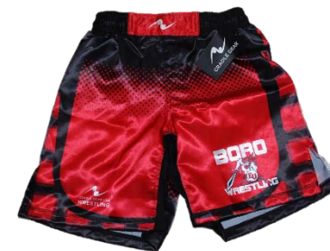
RED MMA SHORT