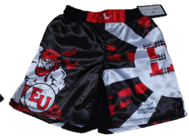
WHITE MMA SHORT